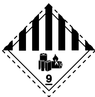
Figure 11 – Package label (mark) for lithium batteries on all packages

NOTE – The label is used also as the dedicated dangerous goods diamond on outer packages with dimensions at least 100 mm each side. If the dangerous goods for transport trigger levels for lithium metal and lithium ion are exceeded this Class 9A diamond must be applied externally to a consignment package in line with all dangerous goods diamond application requirements. For example, under IATA, UN 3480, PI 956 IB, this label is used.