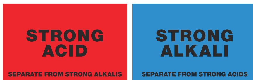
Figure 10 – Examples of special markings for strong acid and strong alkali